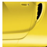
Solar Yellow with Black fabric or Black leather interior